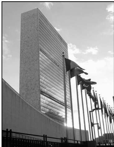
Flags outside the United Nations headquarters. Each flag represents a sovereign state.